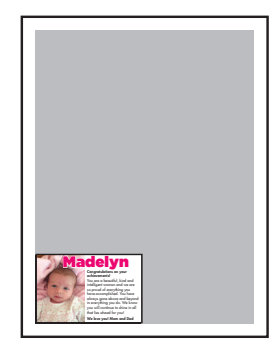
EIGHTH PAGE - $75 3.875" wide x 2.5" tall Includes one photo